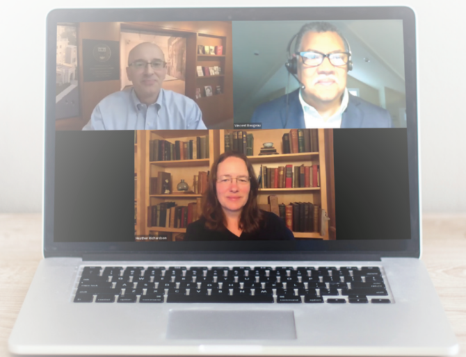
Guests pictured right: